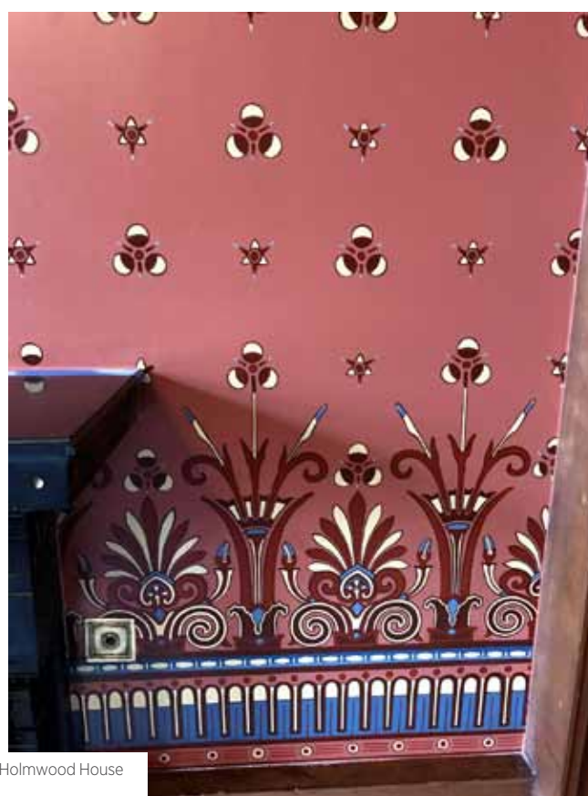
Left - The Egyptian Halls as they could look Middle - Freshly reinstated stencilwork at Holmwood House Right - The Thomson Society are in talks with the Council to repair lighting

decorative scheme in the dining room using the original stencils, they know what's under the layers of paint. Originally the decision was to reveal the image and decorative scheme but that was going to cost an awful lot of money. They have recently changed tack, possibly from concerns of damaging the paintwork and are doing the stencils onto paper."