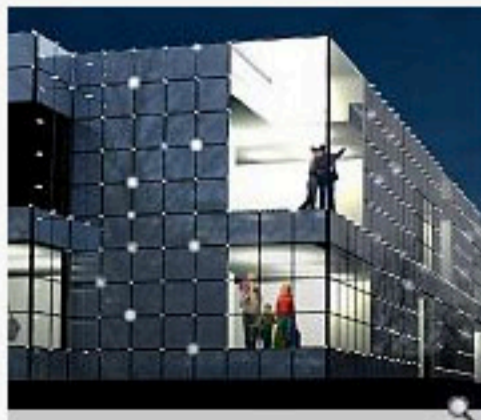
The new extension will be stepped back from the front elevation