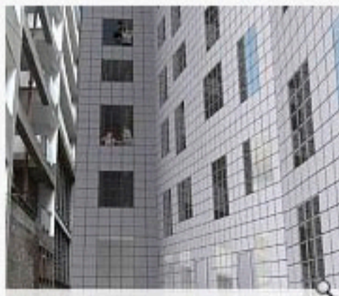
The existing iron framed structure will be retained behind new cladding